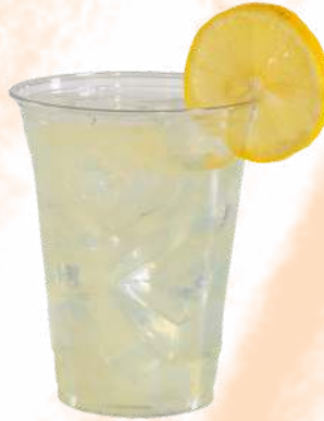
ACTUALLY GOOD LEMONADE