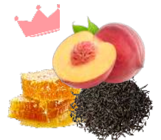
Hot Honey Peach Black Tea