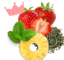
Strawberry Pineapple Green Tea