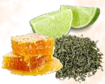
Honey Lime Green Tea