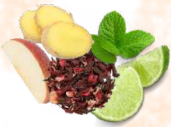
Apple Ginger Hibiscus