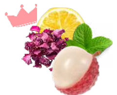
Rose Lychee Mint