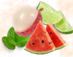
Lychee Watermelon Soda