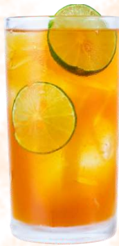
ZESTY MINT BLACK TEA