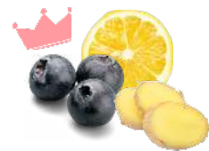
Blueberry Ginger Lemonade