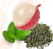
Lychee Mint Green Tea