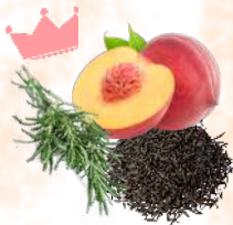
Rosemary Peach Darjeeling Tea