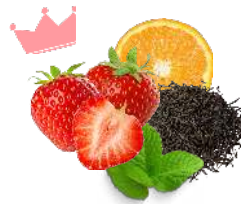
Strawberry Orange Mint Black Tea