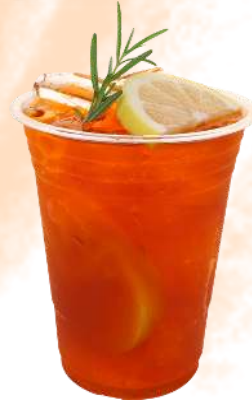
3-2-1 BLACK TEA